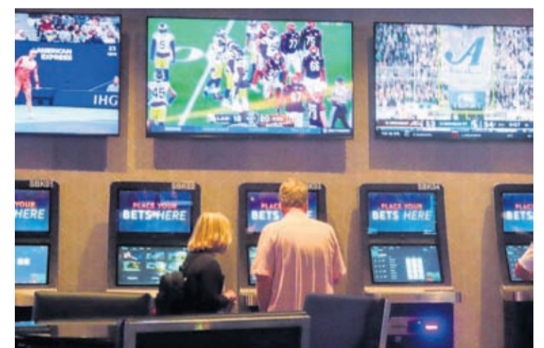
A customer makes a sports bet at the Ocean Casino Resort in Atlantic City, N.J. on Sept. 6, 2022. In the fifth year of legal sports betting in most U.S. states, the action is speeding up due to microbetting, the ability to place a bet on an outcome as narrowly targeted as the result of the next pitch in baseball or the next play in football.

It found no significant differences in sports betting by educational attainment or household income level: 18% of college graduates said they bet on sports in the past year, and 20% of